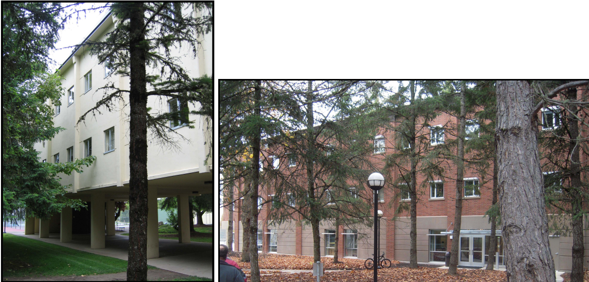
Figure 5. Before (left) and after (right) mitigation of soft-story, collapse-prone building at Western Oregon University in Monmouth, Oregon.

In mid 2005 the Oregon University System obtained its first state funds from the Legislature for seismic mitigation of high risk buildings, which launched the OUS seismic mitigation program. OUS was appropriated $8 million, $26 million, and $31 million for seismic mitigation in the 2005-07, 2007-09, and 2009-2011 legislative sessions, respectively. Figure 5 shows pre- and post-mitigation of a classroom and office building at Western Oregon University, which was a FEMA PDM funded demonstration project.