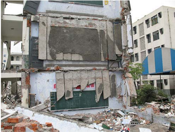
Figure 6. Damage to a school in the 2008 earthquake in China. Floor boards are hanging down on the green chalkboard.

Shining the spotlight on seismically vulnerable schools influenced Governor Kulongoski's decision to include $30 million bond funds in his 2008 recommended budget to the Legislature.