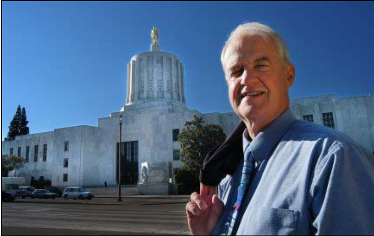
Figure 2. Senator Peter Courtney ( http://www.leg.state.or.us/senate/senpres/home.htm ).

Senator Courtney's Senate Bills 14 and 15 require high-occupancy public school buildings and emergency facilities to have life safety standards, which are set forth in the Oregon Revised Statute (ORS) 455.400, as detailed by Alesch et al. (2004). ORS 455.400 mandates public school buildings with greater than 250 occupants and fire stations, police stations and hospitals to achieve life safety standards in major earthquakes with 30- and 20-yr timelines, respectively. ORS 455.400 further requires evaluation of these public school buildings and emergency facilities using FEMA rapid visual screening methods for seismic vulnerability by January 1, 2007. High-risk buildings are to be mitigated ( www.leg.state.or.us/ors/455.html ).