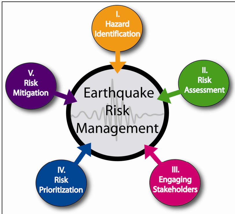
Figure 7. Earthquake risk management approach.

Looking beyond Oregon, a U.S. Government Accountability Office (GAO) study to identify high-risk schools in seismically active regions should be conducted and could include mitigation strategies. Federal assistance to other states, perhaps through the National Earthquake Hazards Reduction Program or FEMA PDM program, should be expanded to improve the nation’s resiliency to natural disasters.