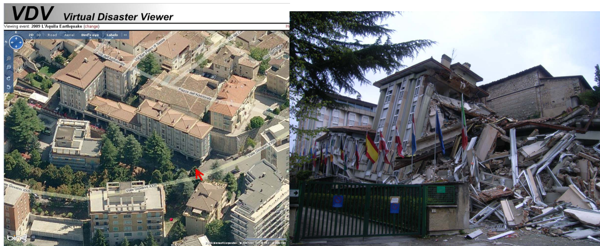
Figure 1. VDV is a social networking platform for disaster research. Users upload photos and experts interpret them in the context of spatial data. In this image, the Pictometry data in Bing provides users with information that this collapsed building in La' Aquila had a "soft story", or parking under the structure. This would be difficult to determine from the damage data alone.

certain buildings looked before they fell down. Additional multi-modal data streams can be mined, or fed directly into similar online applications. Table 1 examines some of these potential sources.